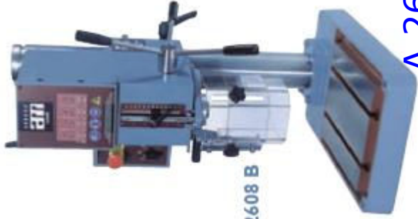
A 2608 B