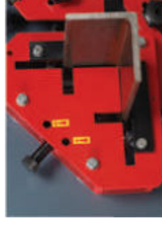
Angle Shearing Station