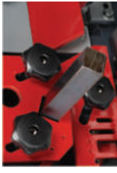
Bar Shearing Station