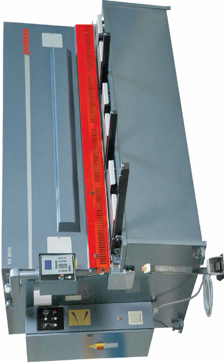
Standard CNC Controller

Heavy duty machines where the operator simply enters in the material thickness, material type and back gauge dimension and the CNC control automatically calculates the optimum setting of blade rake angle and blade clearance. This dramatically reduces the change of operator error and setup time